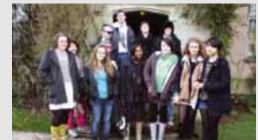
Ikon Youth Programme Members