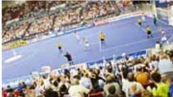
2 July Selco Midland Masters Football The NIA

Selco Midland Masters Football returns to the NIA. Featuring a host of Midlands' football stars, Birmingham will be looking to defend its crown but can expect strong local competition from Wolves, Villa and WBA. Also looking to win their first ever Midlands Masters title are Coventry and Walsall who return after three years away to make their second only ever appearance in the Midland Masters.