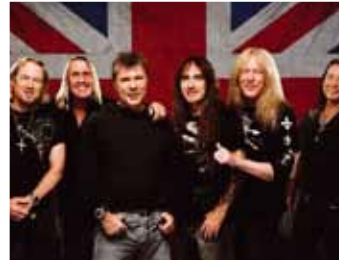
31 July Iron Maiden The NIA

Rock legends Iron Maiden return to the UK for a date at The NIA as part of their Final Frontier World Tour. For the first time in many years the band will be playing shows across the full length and breadth of the UK and intend to play songs from the new album as well as a healthy dose of older fan favourite songs.