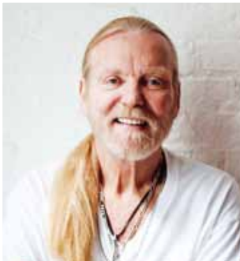
2 July Gregg Allman Symphony Hall

Co-founder of the Allman Brothers band and soulful bluesman Gregg Allman, brings his Low Country Blues tour to the acoustic warmth of Symphony Hall.